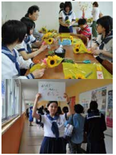
Some scenes from the school's culture festival, including the lecture meeting (bottom)

The lecture helped students link the dreams they have today to the future. Many people visited the school during the festival, and enjoyed two days of fun, entertainment and education. Seiwa-sai was a huge success.