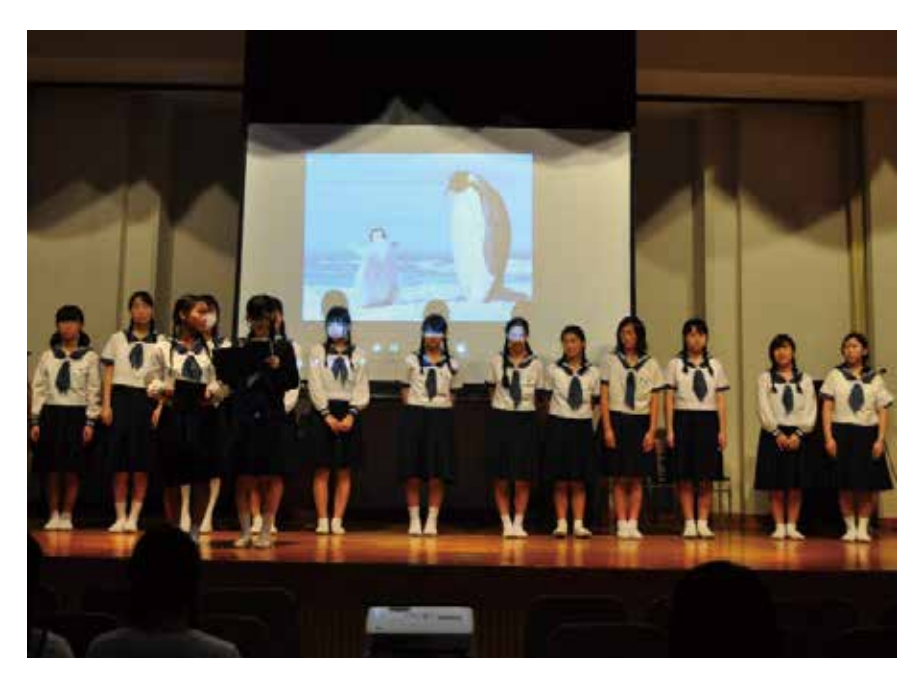
Members of the ESS club make a presentation, using a short music video, at the school festival.

Seiwa-Sai, Seiwa Gakuin's school festival, is held every June under the sponsorship of the student council and the Seiwa-Sai executive committee.