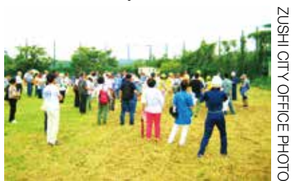
Staff members of JR and Zushi City, and local people take part in an earthquake drill.

as a safe haven and regular disaster drills have helped to ease the anxieties of people in the local community, and brought the school and city even closer.