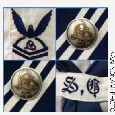
Seiwa Gakuin's logo

the logo's soft-curving lines and powerful straight lines. The letter "L" in the logo is for "LOVE."