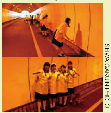
Seiwa Gakuin students help to clean a local tunnel.

Furthermore, Seiwa Gakuin students participate in activities to keep the city tidy, organize "fair trade" events, clean the Hisagi tunnel and promote volunteering in Zushi society.